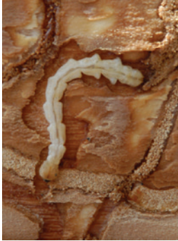
EAB larvae damage the vascular system of the tree as they feed, which interferes with movement of systemic insecticides in the tree.

Application protocols and conditions of the trials have varied considerably, making it difficult to reach firm conclusions about sources of variation in efficacy. This inconsistency may reflect the fact that application rates for soil-applied systemic insecticides are based on amount of product per inch of trunk diameter or circumference. As the trunk diameter of a tree increases, the amount of vascular tissue, leaf area and biomass that must be protected by the insecticide increases exponentially. Consequently, for a particular application rate, the amount of insecticide applied as a function of tree size is proportionally decreased as trunk diameter increases. Hence, application rates based on diameter at breast height (DBH) may effectively protect relatively small trees but can be too low to effectively protect large trees. Some systemic insecticide products address this issue by increasing the application rate for large trees.