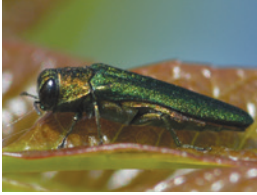
EAB adults must feed on foliage before they become reproductively mature.

The basal trunk spray offers the advantage of being quick and easy to apply and requires